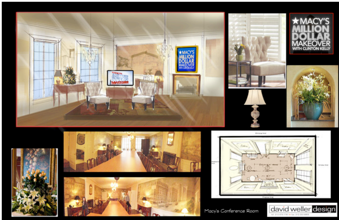
Commercial Reality Interior Design Macy's Million Dollar Makeover with Clinton Kelly