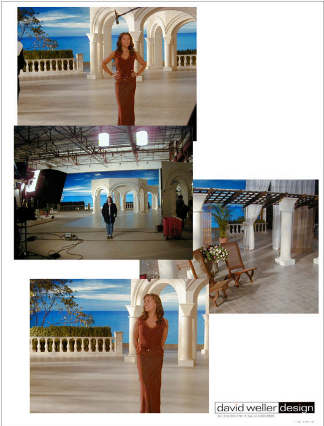
Proactiv with Vanessa Williams Design- Silvercup Studios