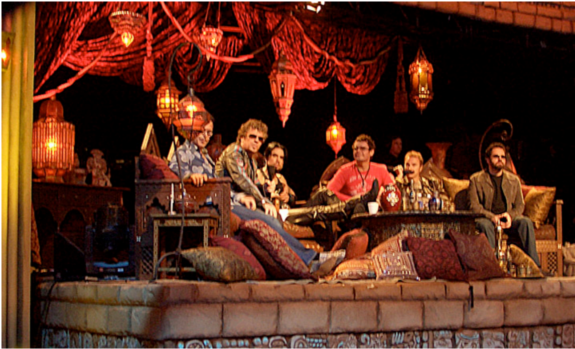
Rock Star Judges Perch- INXS