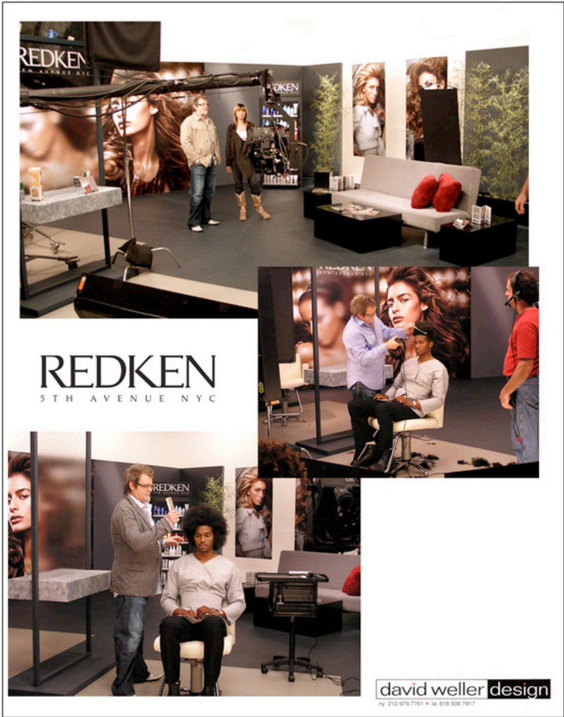
Redken 5 th Avenue Commercial