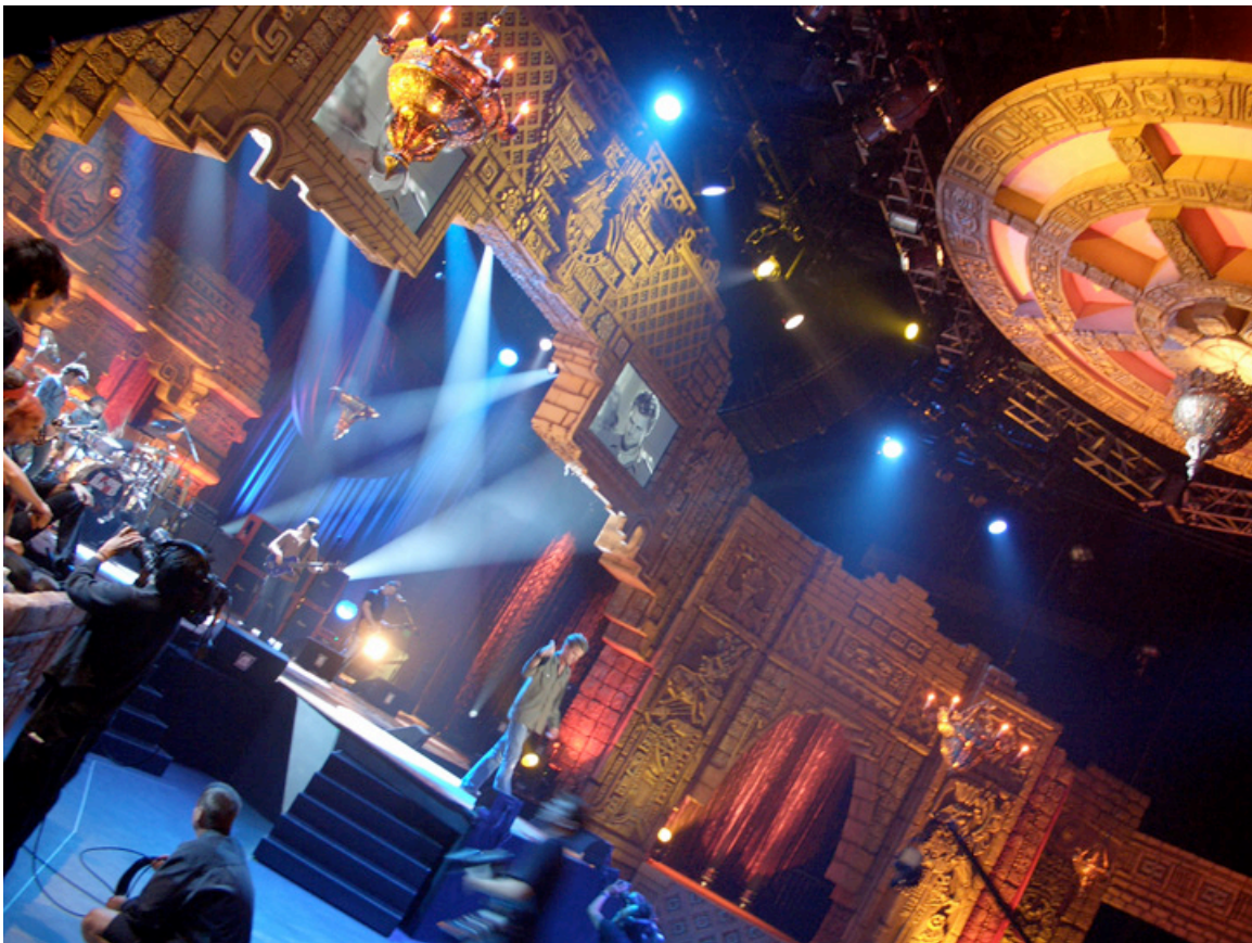
Recreation of the Mayan Theatre with custom forms and Moroccan lamps