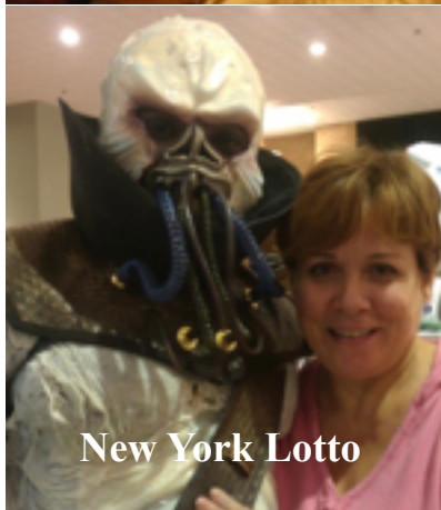
New York Lotto