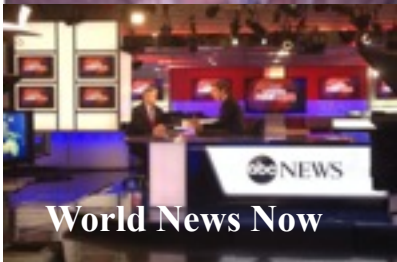
World News Now