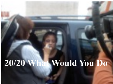
20/20 What Would You Do