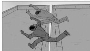
21 DRONE: HIGH OVER Pride and LaSalle as they leap.