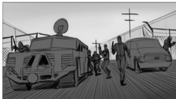
03 SWAT guys exit the rear of the vehicle. LaSalle and 3 officers exit the Bearcat. Pride exits from the Ford Excursion with one officer.