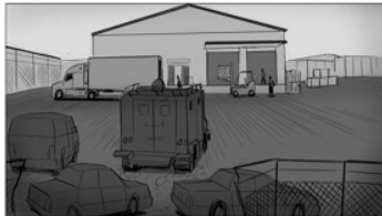
02 The Ford Excursion follows behind and stops in the driveway. Two unmarked Crown Victorias stop to block the fence area.