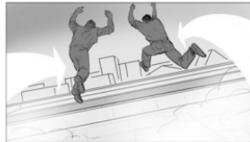
19 WS/MS Pride & LaSalle jump from one building to the next