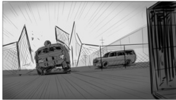
01 SWAT Bearcat breaks through barrier